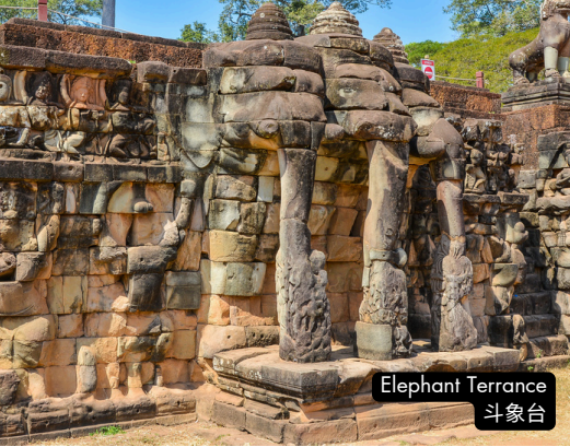
Elephant Terrace 斗象台