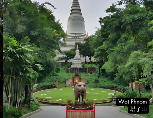
Wat Phnom 塔子山