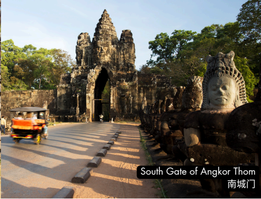
South Gate of Angkor Thom 南城门