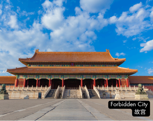
Forbidden City 故宫