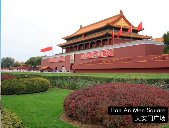
Tian An Men Square 天安门广场