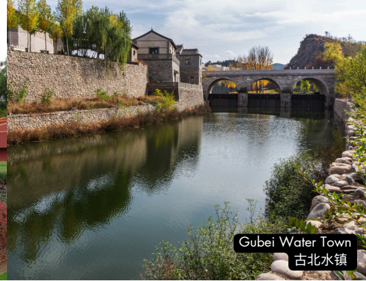
Gubei Water Town 古北水镇