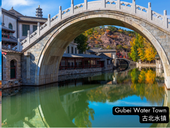
Gubei Water Town 古北水镇