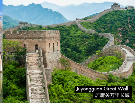
Juyongguan Great Wall 居庸关万里长城