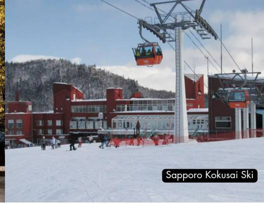
Sapporo Kokusai Ski