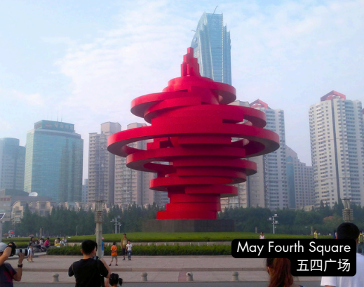
May Fourth Square 五四广场