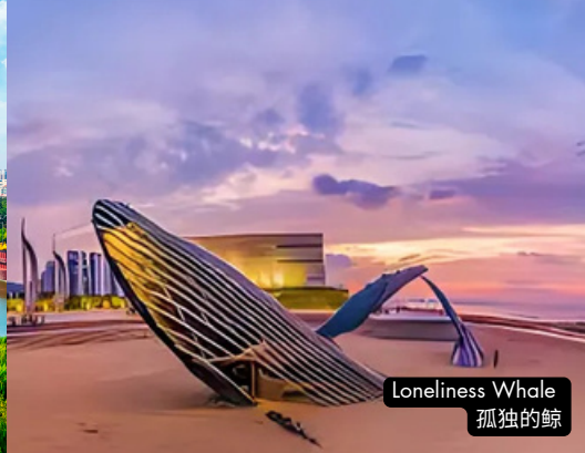
Loneliness Whale 孤独的鲸