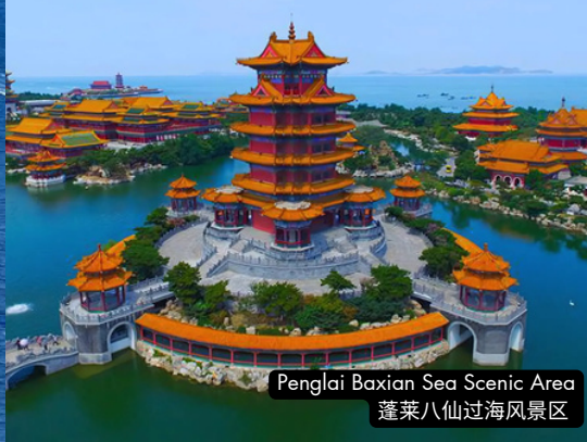
Penglai Baxian Sea Scenic Area 蓬莱八仙过海风景区