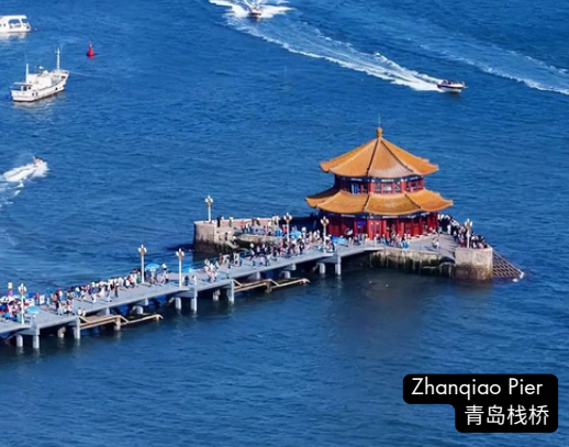
Zhanqiao Pier 青岛栈桥