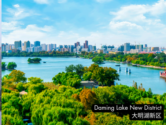
Daming Lake New District 大明湖新区