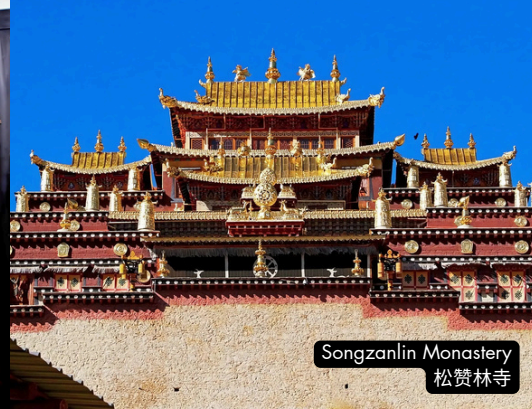
Songzanlin Monastery 松赞林寺