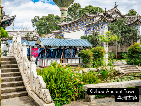
Xizhou Ancient Town 喜洲古镇