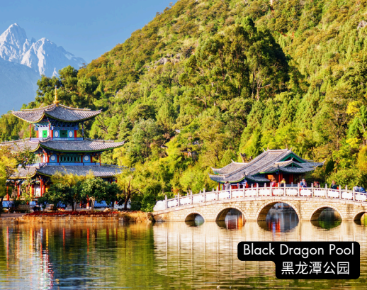
Black Dragon Pool 黑龙潭公园