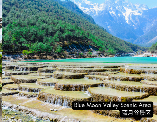
Blue Moon Valley Scenic Area 蓝月谷景区