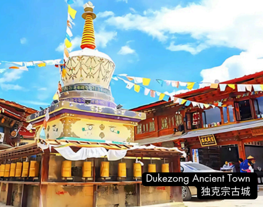
Dukezong Ancient Town 独克宗古城