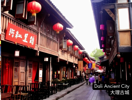
Dali Ancient City 大理古城