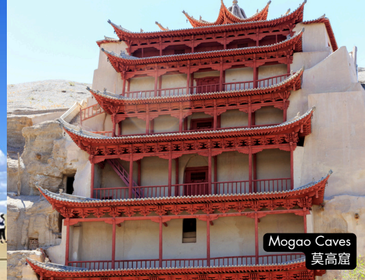
Mogao Caves 莫高窟