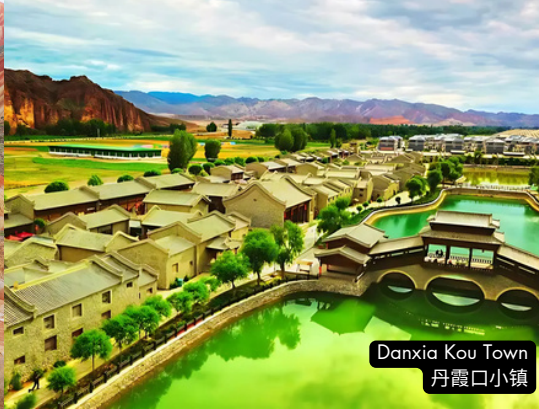
Danxia Kou Town 丹霞口小镇