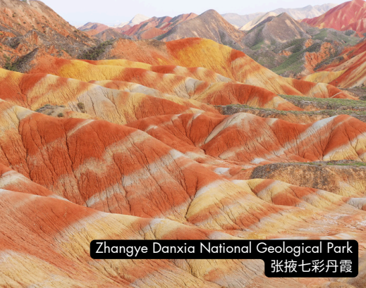
Zhangye Danxia National Geological Park 张掖七彩丹霞