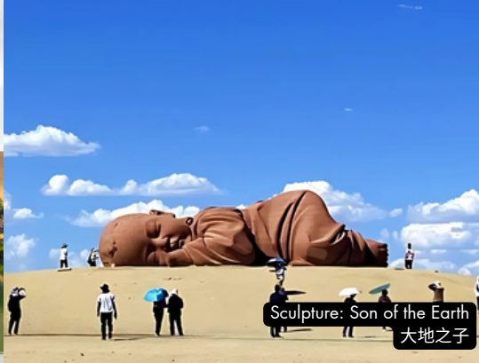
Sculpture: Son of the Earth 大地之子