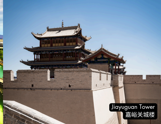
Jiayuguan Tower 嘉峪关城楼