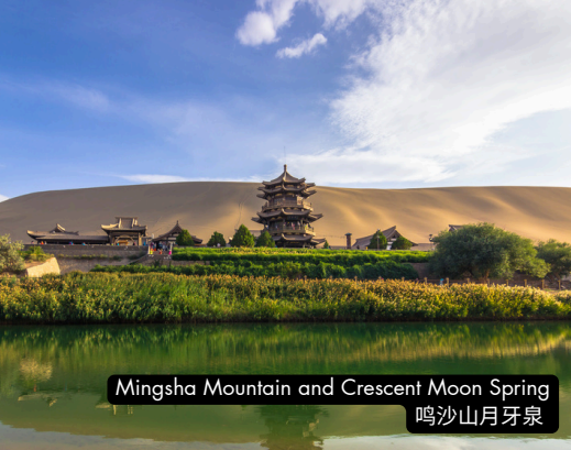
Mingsha Mountain and Crescent Moon Spring 鸣沙山月牙泉