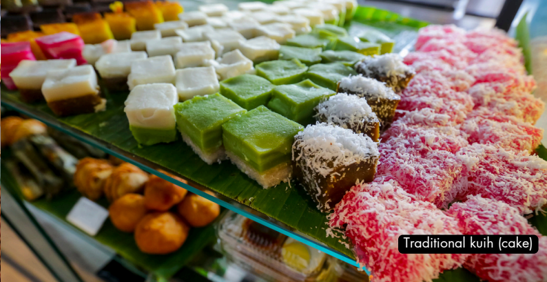
Traditional kuih (cake)