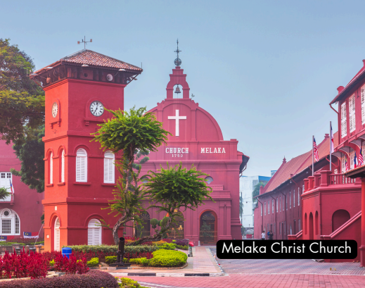
Melaka Christ Church