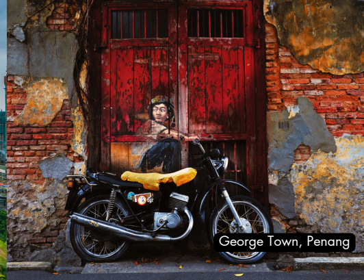
George Town, Penang