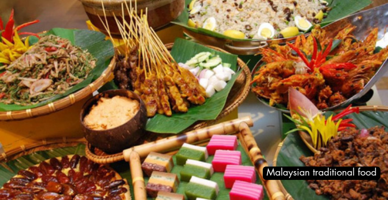
Malaysian traditional food