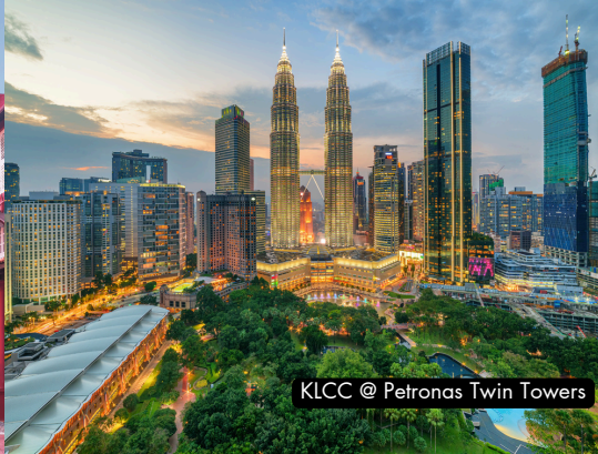
KLCC @ Petronas Twin Towers