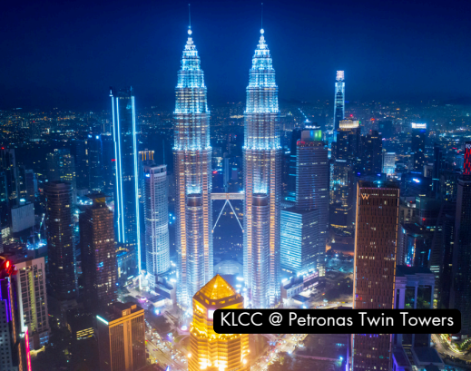
KLCC @ Petronas Twin Towers