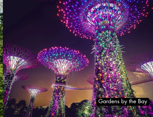
Gardens by the Bay