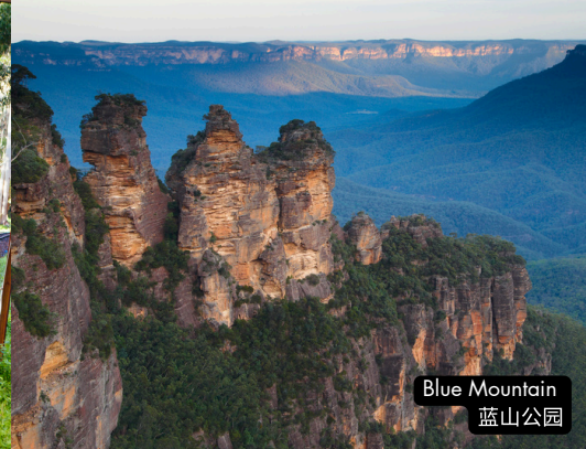
Blue Mountain 蓝山公园