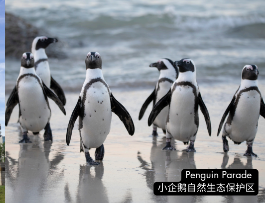
Penguin Parade 小企鹅自然生态保护区