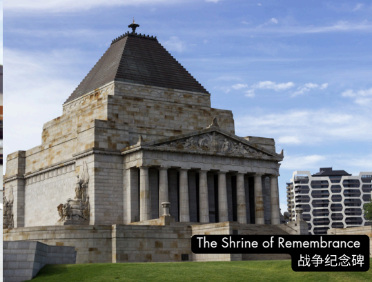
The Shrine of Remembrance 战争纪念碑