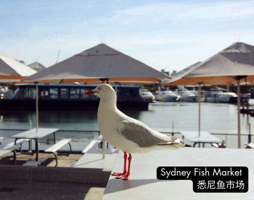
Sydney Fish Market 悉尼鱼市场