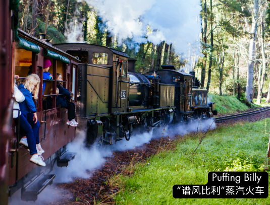
Puffing Billy “谱风比利”蒸汽火车