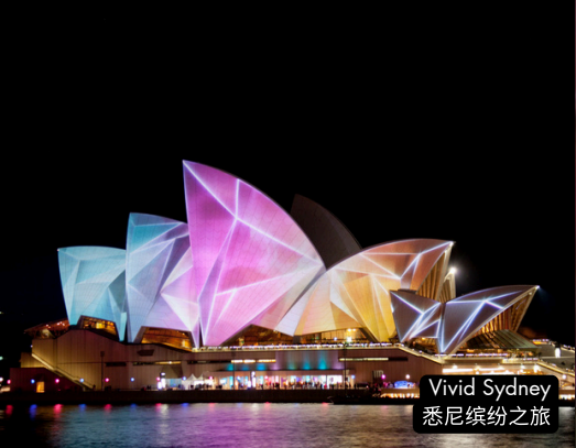
Vivid Sydney 悉尼缤纷之旅